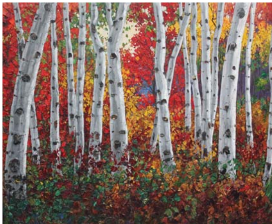
"Autumn Jewel," 48 x 60 inches