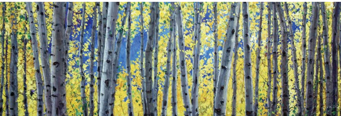
"Autumn Sunlight," 24 x 72 inches

Vranes says her decision to switch from painting portraits to landscapes continues to pay dividends today. "For me, each painting I create reflects my own private utopia," she says. "In a nation of growing uncertainty, I want my paintings to provide the viewer a momentary escape from reality. We all wish we could retreat into a more peaceful and happy world. What better escape than into a beautiful landscape! My art carries that magic."